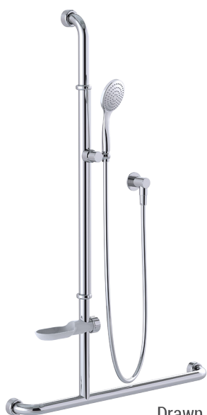
Drawn LH (Left Hand)